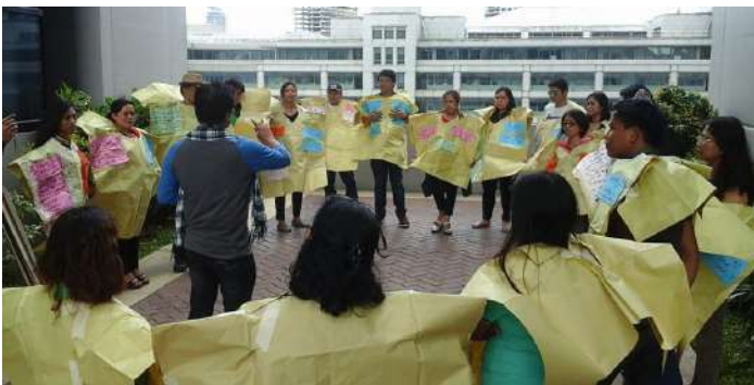
Participants during one of their workshop

Moving forward, EP will continue to operationalize its strategic directions through the different departments as captured in their Key Result Areas (KRAs). For 2016, the major deliverables are continued unit/branch expansion, product development through introduction of new portfolio mix models, systems improvement (MIS), and continuous capacity building of staff.