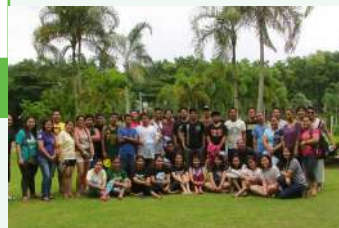
SOUTH LUZON August 7- 8, 2015 Momarco Resort, Tanay, Rizal