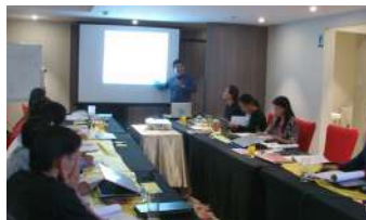
Project Management Training

An interactive 2-day training designed for middle managers who take on projects or programs outside their usual functions. The training helped participants understand the basic concepts of project management in order to ensure projects are administered properly, on time, and on budget.