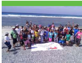
NORTH LUZON October 16 - 17 Morning Seven Luna, La Union

The two-day training focused on understanding basic accounting principles and financial statement and financial analysis. The 1st day focused more on lectures and discussions; while on the 2nd day, the participants were engaged in workshops. The participants highly appreciated the seminar as the topic is very much relevant to their respective roles as supervisors and managers particularly in analyzing and interpreting financial statements to determine profitability and sustainability of their units/branches.