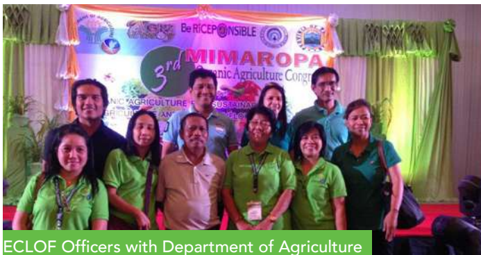
ECLOF Officers with Department of Agriculture

Last September 28-30, 2015, key officers from EP Head Office attended the 3rd MIMAROPA Regional Organic Congress at the Skylight Convention Center in Puerto Princesa City, Palawan.