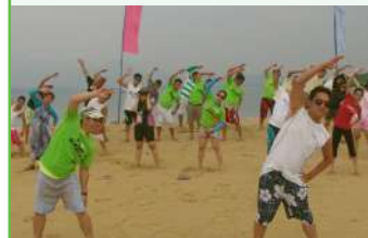
PALAWAN October 2 - 3, 2015 Royal Oberoi, Puerto Princesa, Palawan and Luli Island