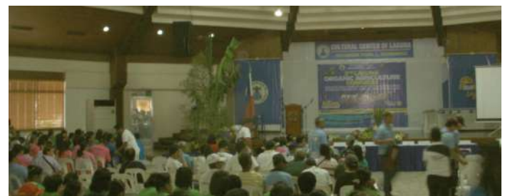
DA recognizing farmers who have participated on their project on organic farming

Looking forward this 2016, EP will further actively participate in these kinds of local gatherings where we will be able to learn more and expand our partnership with same-minded organic advocates and practitioners. It will be an organic, dynamic growth!