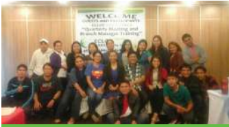
Branch Manager Training

Participated by candidates for BM, 4 current FAOs, and Area Managers, the 2-day training aimed to review job descriptions; understand the transition process that the participants are undertaking in the light of EP expansion; have a deeper understanding of roles and functions; set up a system for unit monitoring on KRAs; and draft a reintegration plan that will serve as the basis for their superior's monitoring and follow up.